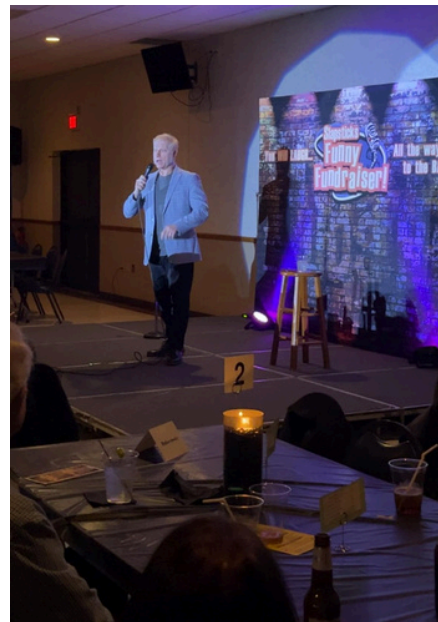
Comedy Show Fundraiser