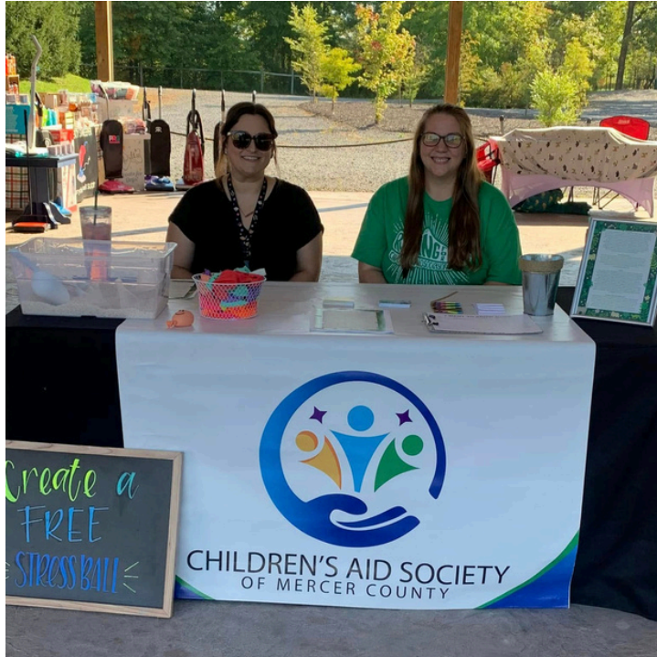
Keystone Safari Small Business Days