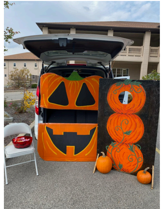
Trunk or Treat at the Lakes at Jefferson