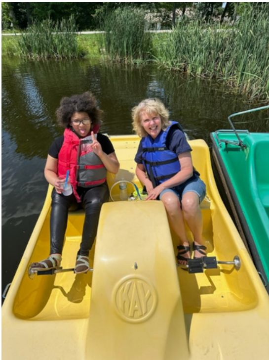
Mentee with her mentor

Our mentoring program is designed so mentors can meet the youth where they are and help them get where they need to be, while serving as a support system. Whether it is establishing a relationship with a 14 year-old, helping an 18 year-old apply for college, or helping a 23 year-old apply for a job, mentors are needed to prepare the youth for what lies ahead as they transition to adulthood. This program gives young people the role model they may never get otherwise. It helps them with skills, but at the core, it guarantees that they will always have someone that cares about them and that they are not alone.