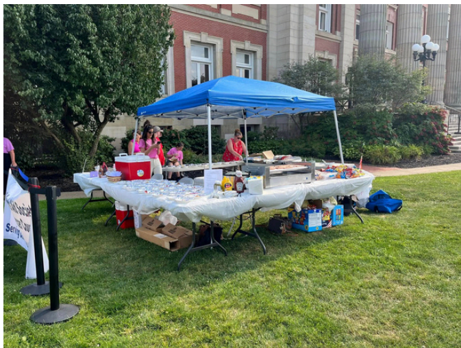
Ice Cream Social on the Square