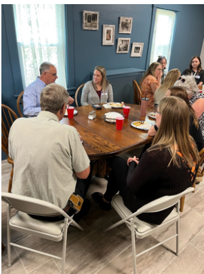
Annual Board Member and Staff Luncheon