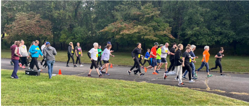
Our First 5K was a success