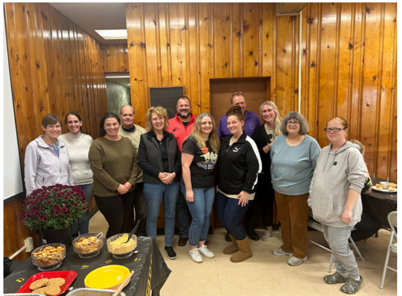
Annual Mentoring Luncheon

"You are the person I have been dreaming of." -Mentee meeting her Mentor for the first time.