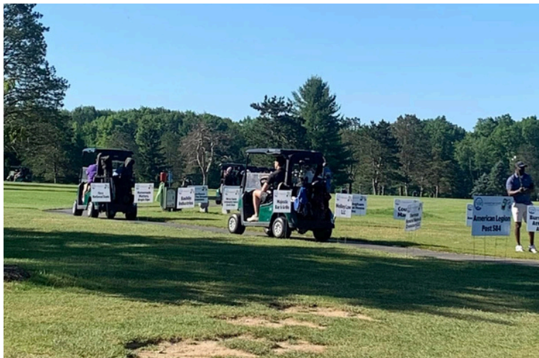
22nd Annual Golf Outing