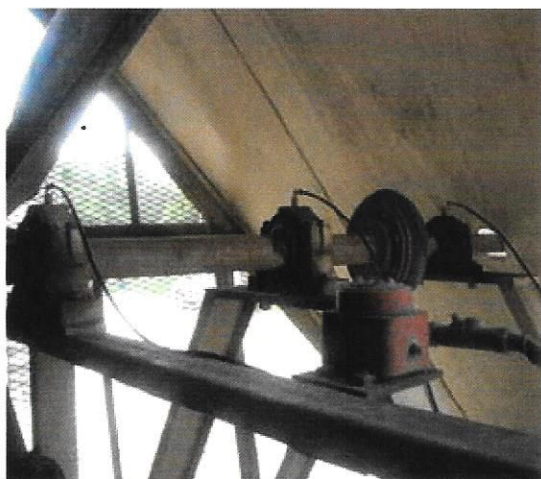
Gas engine compressor fan. Three middle bearings shown with perma 90° tube adapter and 5/16" tubing that is run from externally mounted perma PRO MP-6 automatic lubricators.