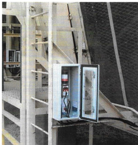
perma PRO MP-6 mounted in enclosure box on gas compression engine cooling fan.

The utilization of the perma PRO lubricating critical pieces of equipment saves time. Standard lubrication on the compressor is required at least every few weeks. With time at a premium, this is often missed or disregarded until time is available. The perma PRO provides consistent lubrication 24 hours a day, 7 days a week with no worry. You only need one easy change out, once every 4 to 12 months, for the vast majority of your equipment. You can rely on perma to deliver fresh, clean lubricant, when and where you need it, without assistance.