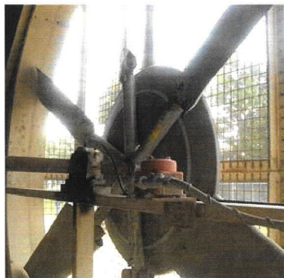
Tubing from PRO MP-6 being run to end bearing on gas compression engine cooling fan.

The time saved with automatic lubrication systems from perma can be invested in other value-adding maintenance tasks, including regular inspections of equipment and lubrication systems, basic condition monitoring, oil sampling and filtration.