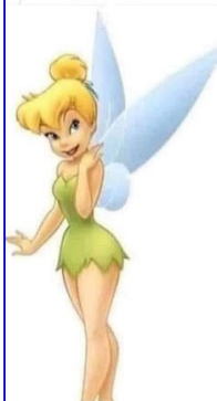
Tinkerbell and her cousin, Tacobell!