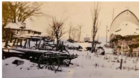
Steele Wagon at the Steele Farm