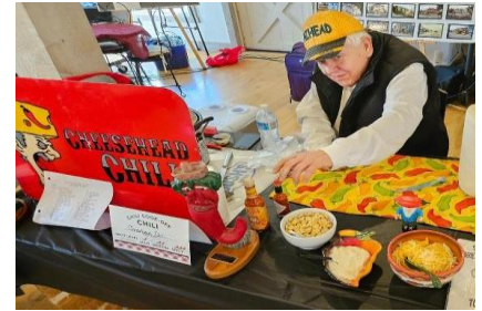
1 st Place – Cheesehead Chili

for next year's showdown, one thing remains certain: the Chili Cook-Off fundraiser will continue to be a spicy highlight on the community calendar, uniting chili aficionados and benefactors in a celebration of flavor, fun, and giving back.