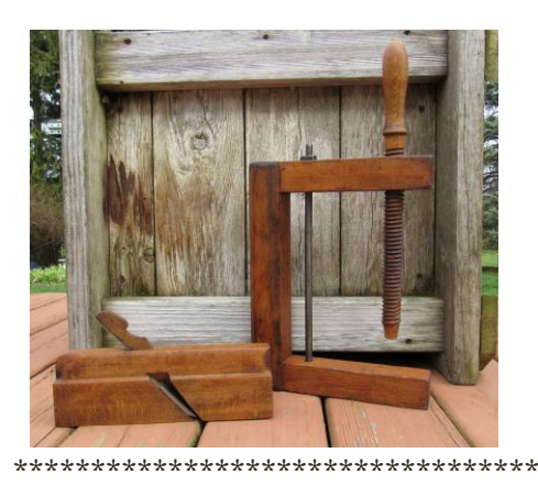
(Pewaukee's industry continued from page 3)

from Pewaukee were used in rebuilding Chicago after the great fire in 1871.