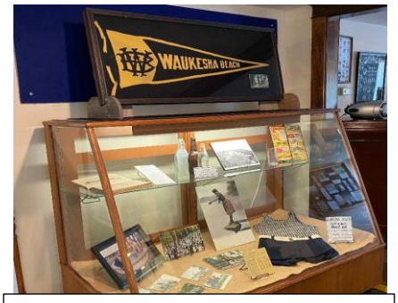
New Waukesha Beach Display