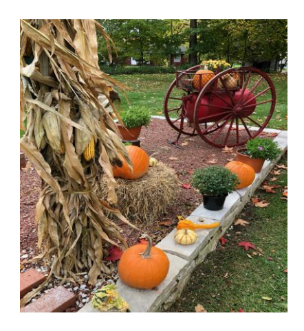
What a difference a day makes!!

It was fun to do and have a place to do it. Thanks to all who contributed ideas and the legwork to make it happen. (PS: Not a gord or pumpkin had been touched! . . . .