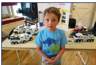
Adorable Little Boy