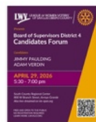
Board of Supervisors District 4 Candidates Forum

Wednesday, April 29 5:30 – 7:00 pm S. County Regional Ctr 800 W. Branch Street Arroyo Grande