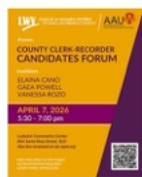
County Clerk-Recorder Candidates Forum

The League of Women Voters of San Luis Obispo County is partnering with local organizations to present in-person candidates forums intended to provide the public with an opportunity to learn about the candidates and their views on the issues. Attend the forums and submit questions on the issues that are applicable to all the candidates there. Forums will also be live-streamed on slo-span.org and available on the League's YouTube channel for later viewing. For additional information contact the League of Women Voters at (805) 242-6990 or candidateforums@lwvslo.org .