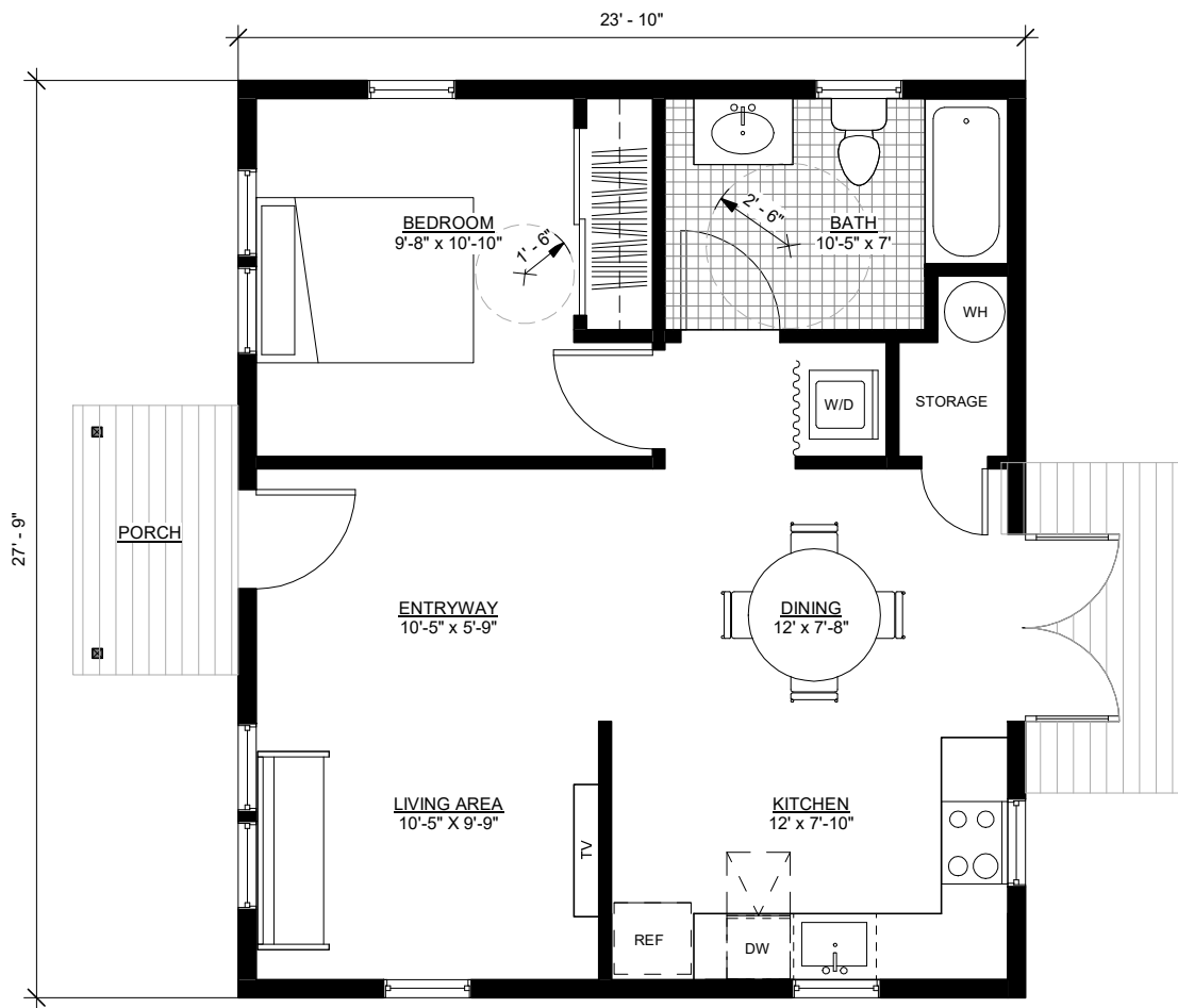
01 Floor Plan - Option 1 1/4" = 1'-0"