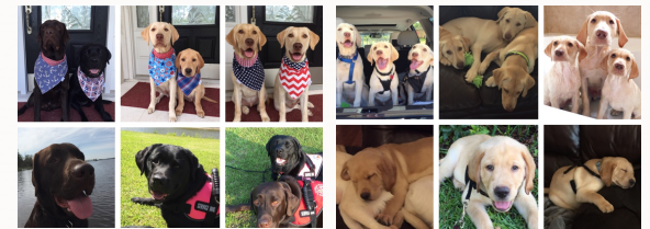
English Labrador Retrievers can handle most anything

Increase Safety: Many children with autism have no concept of danger and run away. Our dogs can be tethered to your child and trained to take commands from you. The tether prevents your child from going any further than it allows and provides you with an added sense of security.