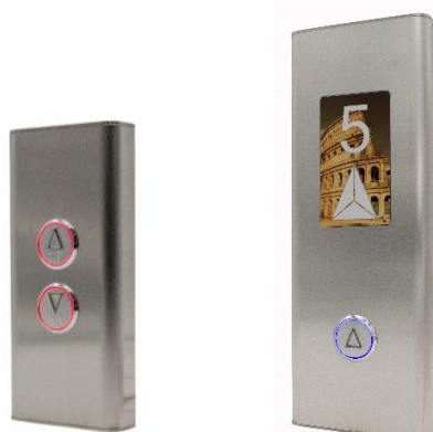
Standard or with integrated indicator