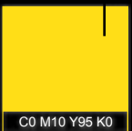
Core of the Flame Primary Color