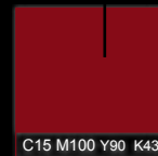
Heart of the Flame Primary Color

These hues blend and dance like a flame, creating a mesmerizing spectacle. The fluid movement of the flame inspires dancers to express themselves with similar grace and intensity. The colors of a flame mirror the dancer’s journey—full of passion, creativity, and energy, captivating everyone who watches.