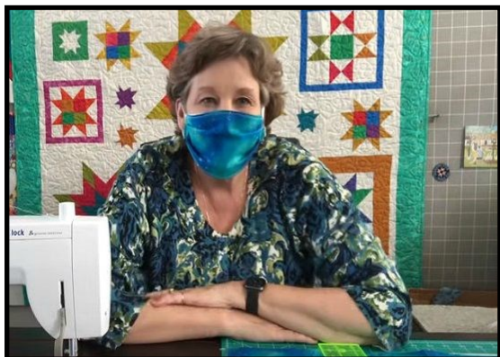
Lodge says that masks are mandatory.

Hello Quilters!! Happy New Year and here's for a healthy 2021!!! It seems like forever since we have seen each other. I am looking forward to Spring Retreat and hope that many of you are also. We have classes scheduled and the lodge is waiting to make reservations! We want this retreat to be fun, a good learning experience and safe for all of us. Looking forward to seeing you and making this retreat one of the best!!