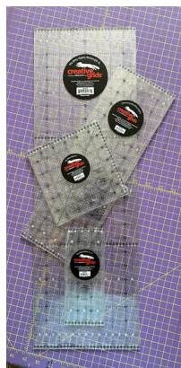
Set of Creative Grid rulers

Get your tickets from QQSO Ways & Means - Sue Roy