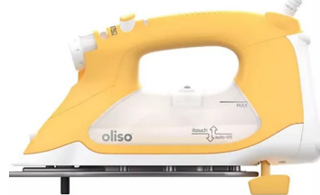
Oliso Steam Smart Iron

The Fall Retreat Block Lottery will be a 12 1/2" Churn Dash block using a bright white background and bright colors for the block.