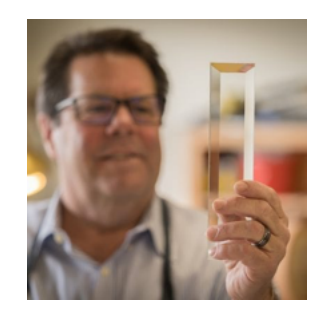
A TOUCH OF GLASS: BEND ARTISAN'S STAINED GLASS REVIVAL.