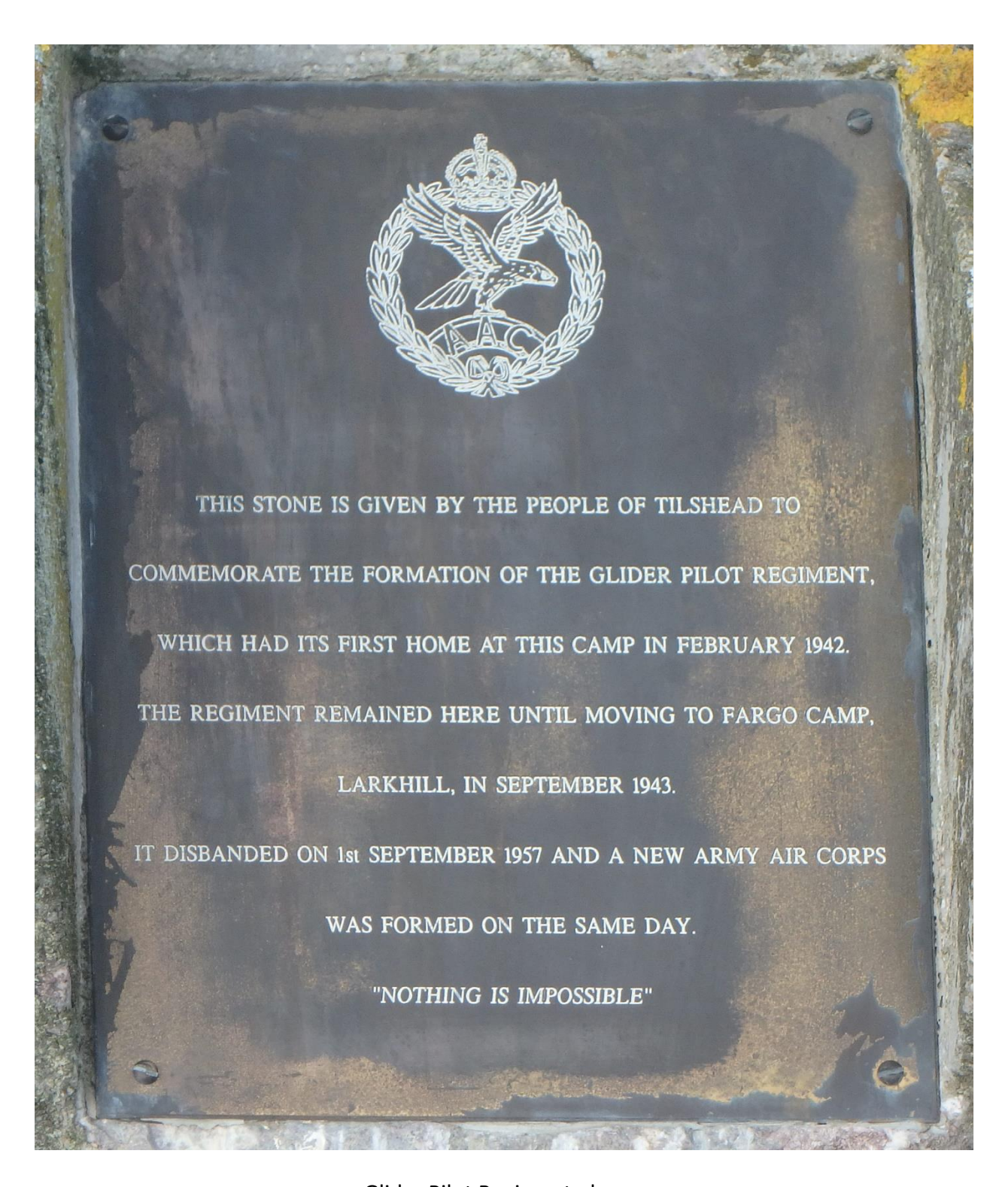
Glider Pilot Regiment plaque