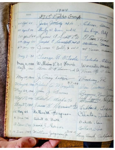
A page from the Bisterne Manor Guest Book from 1944