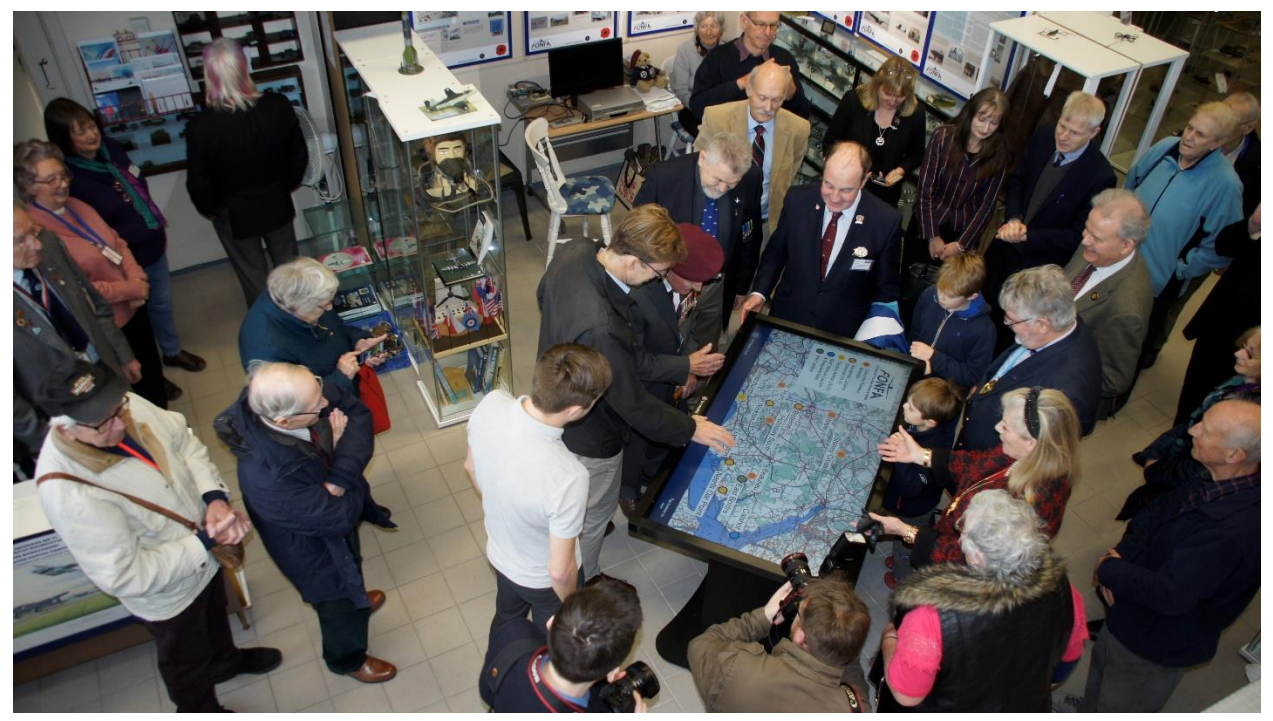
Assembled guests viewing the interactive 'Welcome' touch table