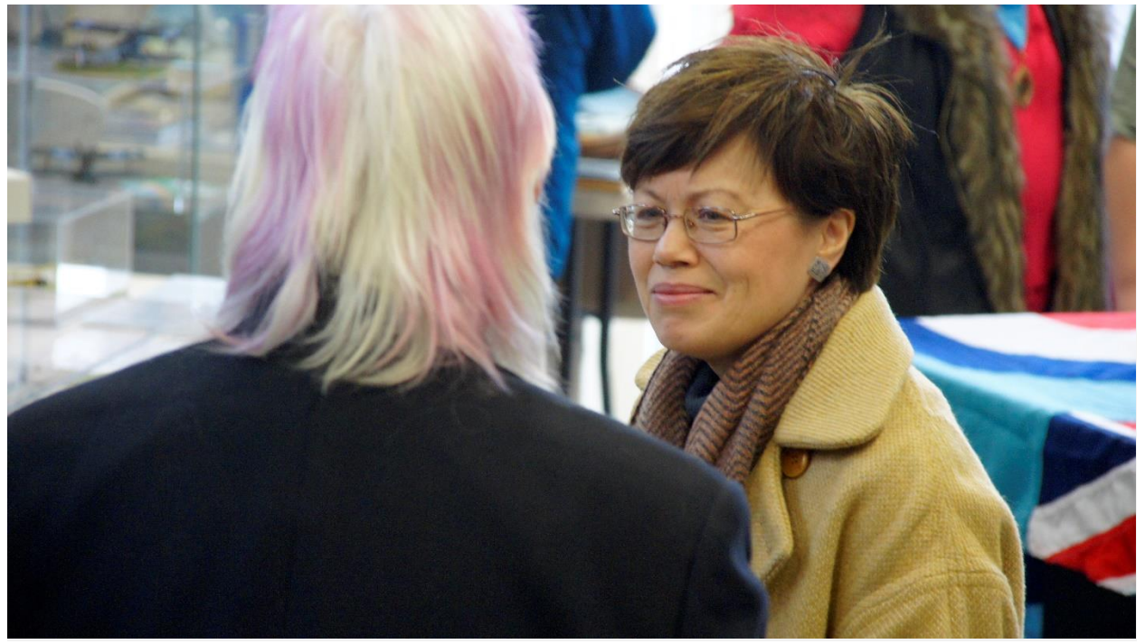
FONFA Patron, Lady Montagu, in conversation with an SAS Veteran (presently supporting a breast cancer charity)