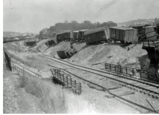
Strafing attack taken from Capt Mohrle's gun camera The result of a dive bomb attack by 510<sup>th</sup> Group

The first day of June, typical of this period before D-Day, saw 18 aircraft provide escort to B-26 Marauders bombing gun positions at Le Havre with 36 more aircraft escorting B-26s bombing gun positions at Mount Fleury.