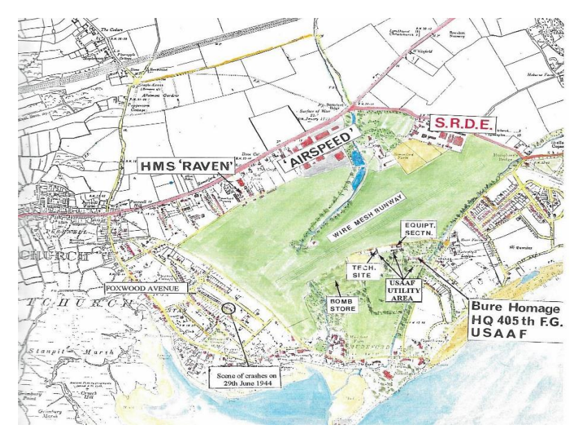
Christchurch Airfield April 1944

The existing grass airfield at Christchurch was not large enough for the intended aircraft so farmland to the northeast of Mudeford Wood was utilised for runway. This involved the removal of part of Mudeford Wood and the construction of a culvert to bridge the Mude Stream.