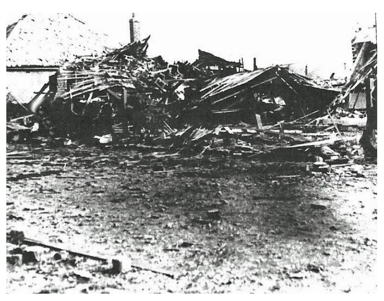
Devastation in Foxwood Avenue