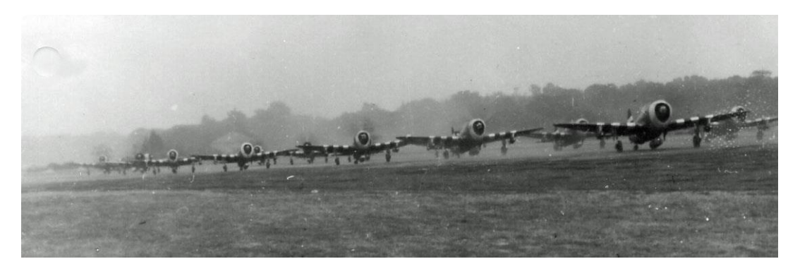
P-47 Thunderbolts of the 510<sup>th</sup> Group line up for take-off on the 6<sup>th</sup> June 1944

The first day of June, typical of this period before D-Day, saw 18 aircraft provide escort to B-26 Marauders bombing gun positions at Le Havre with 36 more aircraft escorting B-26s bombing gun positions at Mount Fleury.