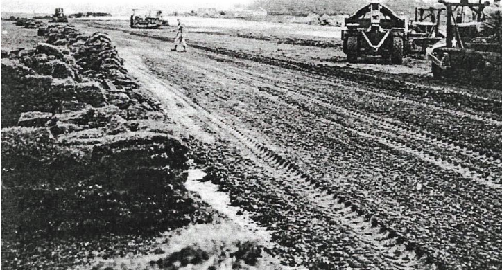
In March 1944 the 833 Engineering Aviation Battalion US Army arrived with heavy equipment

The runway surface needed to be capable of withstanding the weight of a 4.5 ton aircraft carrying over a ton of ordinance. The surface was initially laid with Sommerfeld tracking but this was found to be inadequate, so the runway had to be upgraded with square mesh tracking.