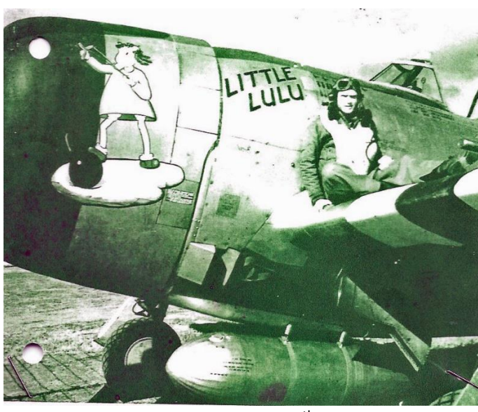
Major Bruce Parnell C.O. 510th FS Little Lulu

During May1944, with the approaching invasion of Europe, the Group was active escorting heavy bombers of the 8<sup>th</sup> Air Force, bombing marshalling yards and strafing railway trains, goods wagons and radio stations to deprive the enemy of supplies.