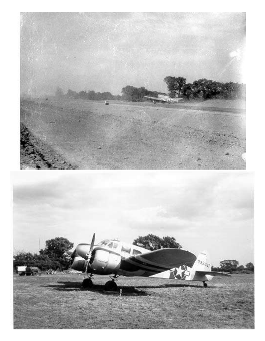
Views across Winkton ALG, The first shows a P47 probably on the westerley runway, the second a visiting Cessna UC78 Bobcat communications and administration aircraft.