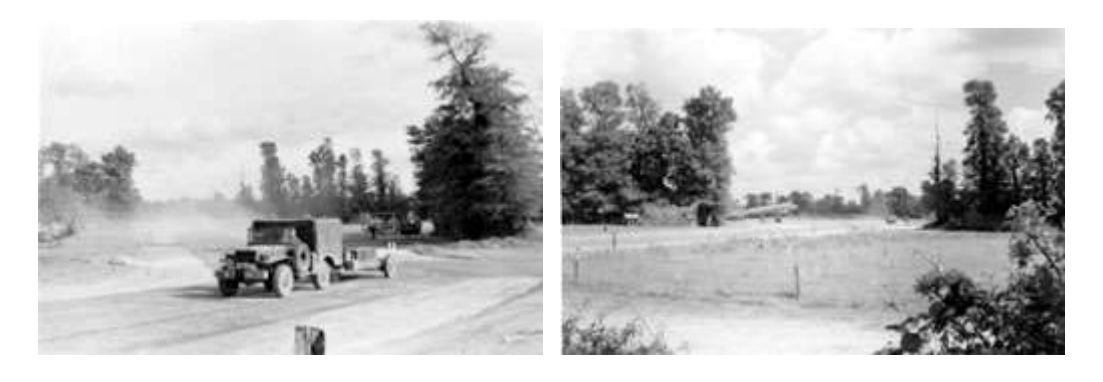
Views showing the area of Clockhouse Copse and the temporay roads and clearings made by the RAF and USAAF in 1943-44

The 9th Air Force had four advanced landing grounds in the Avon Valley or south west Hampshire. The Avon Valley has a high water table and building the