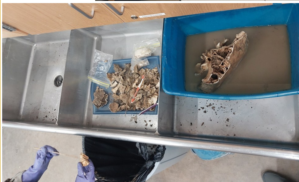
Charlene performing expert work on bison.