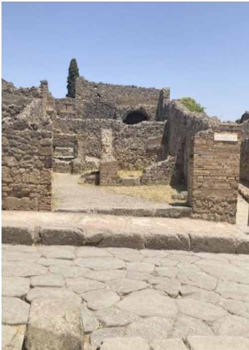
House of Octavius Quartio; Drainage Canal in Foreground