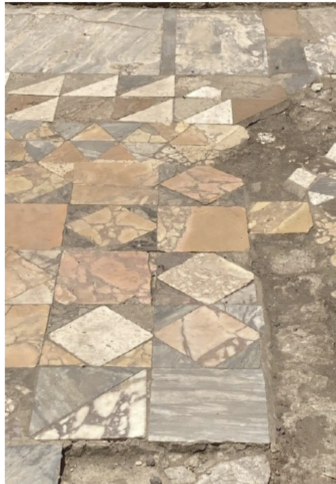
Exquisite Flooring Tiles