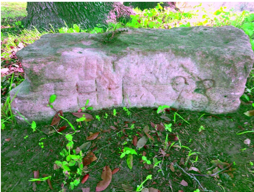
A historic headstone with DStretch applied (RGB) to enhance the inscription.