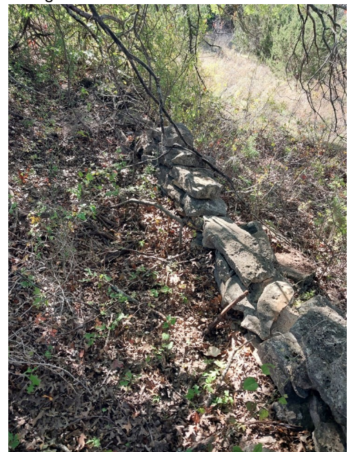
Historic stacked stone wall on the ranch.