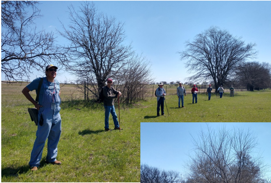
Left: Several members spread out and prepare for survey.