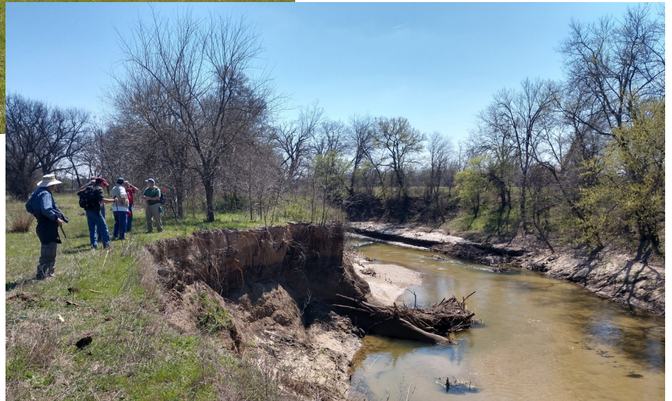
Below: NTAS members overlooking Denton Creek