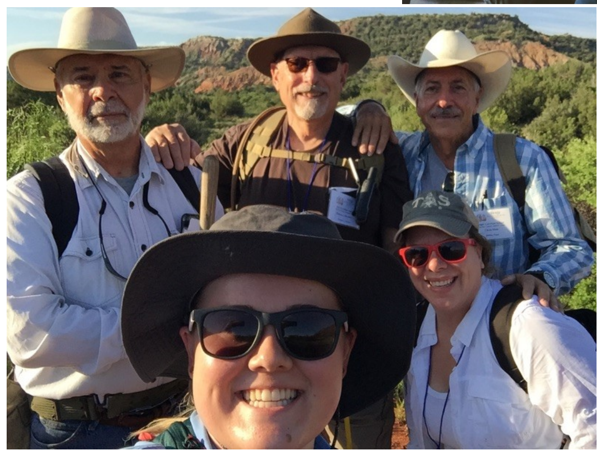
North Texas Archeological Society