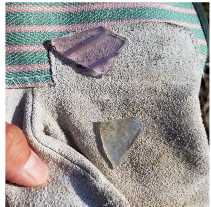
Figure 2. Sample of surface artifacts from the historic archeological site. Top: solarized glass. Bottom: window glass.