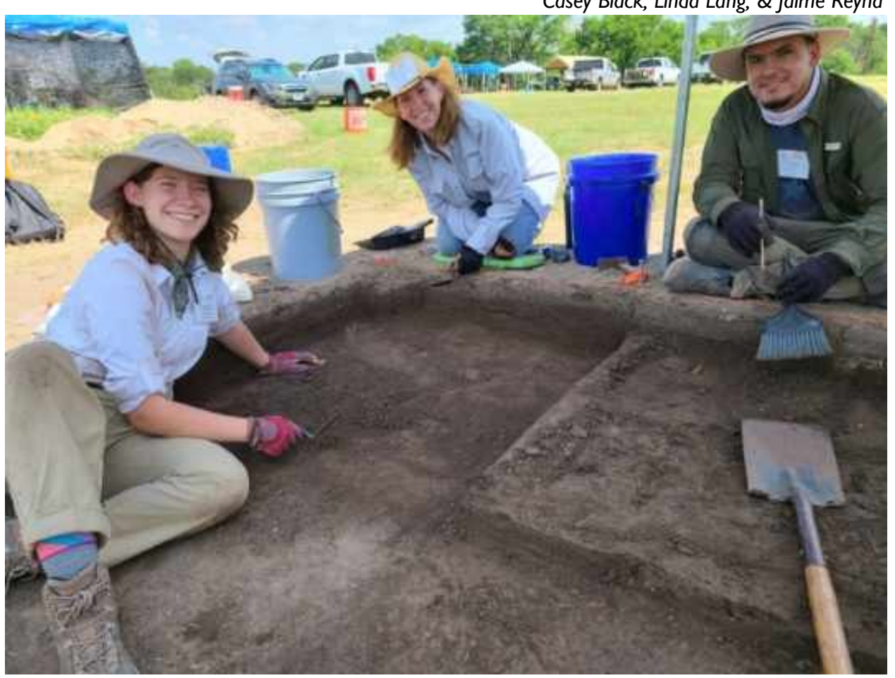
North Texas Archeological Society