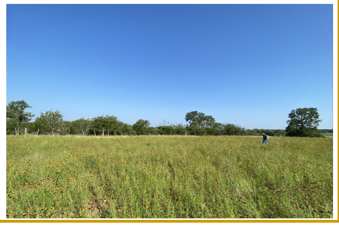
North Texas Archeological Society