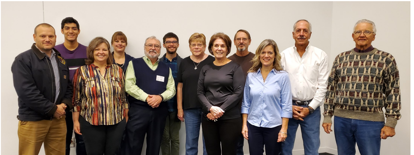
NTAS volunteers at the Perot's "A Day in the Life: Archaeologist"