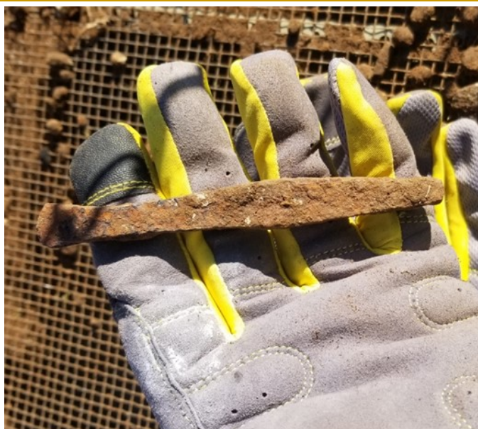
Horse rasp (left) and chisel (right) from site 41DN617, Tom Cook's Blacksmith Shop.