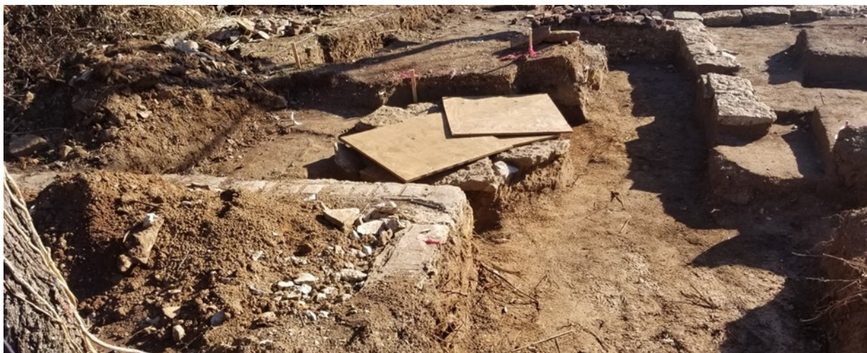
Hotel foundation (above) and hotel well (right) from site 41DN593, Sartin Hotel.