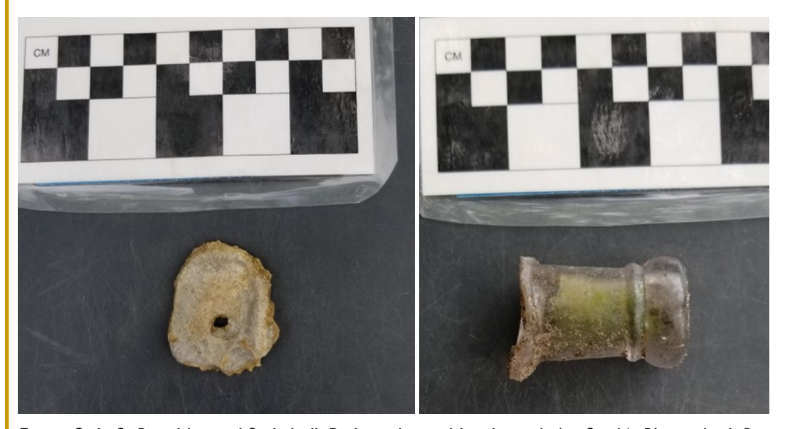
Figure 2. Left: Possible modified shell. Right: solarized bottle neck (or finish).