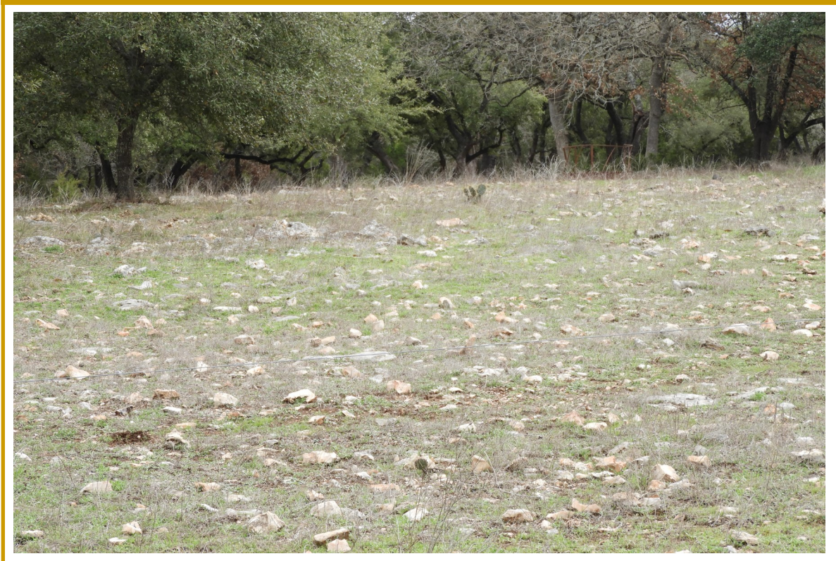
Artifacts litter the surface, captivating the members on the tour (photo courtesy of Lori Connolley).

Tom Williams demonstrating Paleoindian hunting techniques (photo courtesy of Lori Connolley).