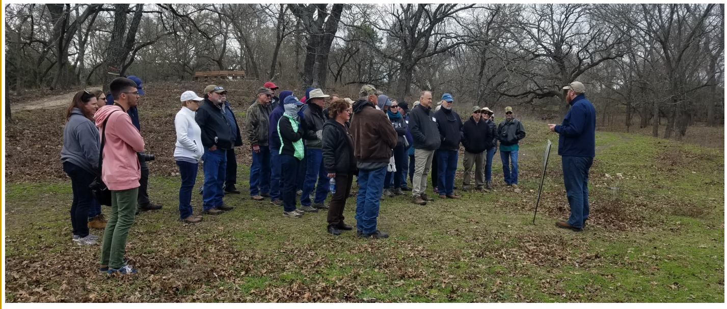
NTAS members gather to hear about the mammoth found at the site.

The entry gate.