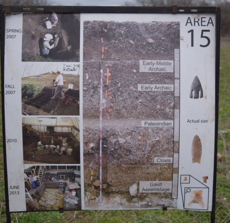
Interpretive sign at Area 15, where nine years of excavation uncovered millions of artifacts.