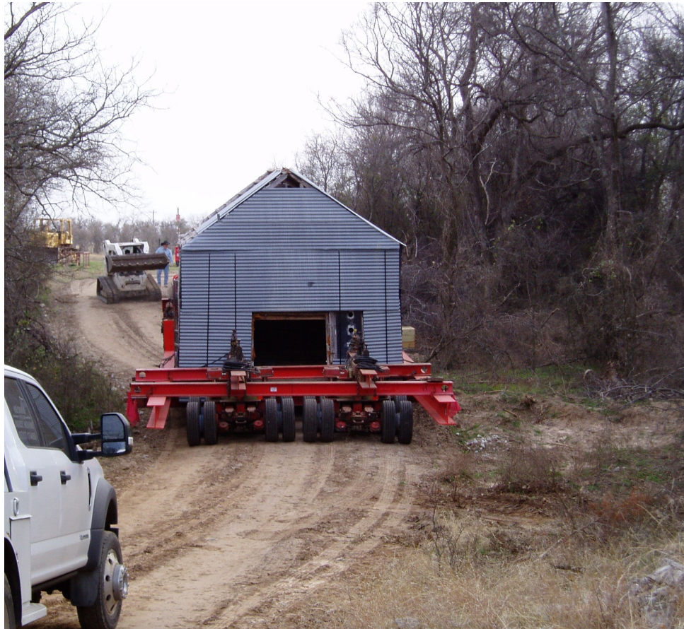
North Texas Archeological Society

https://www.weatherforddemocrat.com/news/ local_news/newberry-cabin-moved-to-dosscenter/article_b20cd64a-dd88-5ec2-8091-2d080b278e27.html