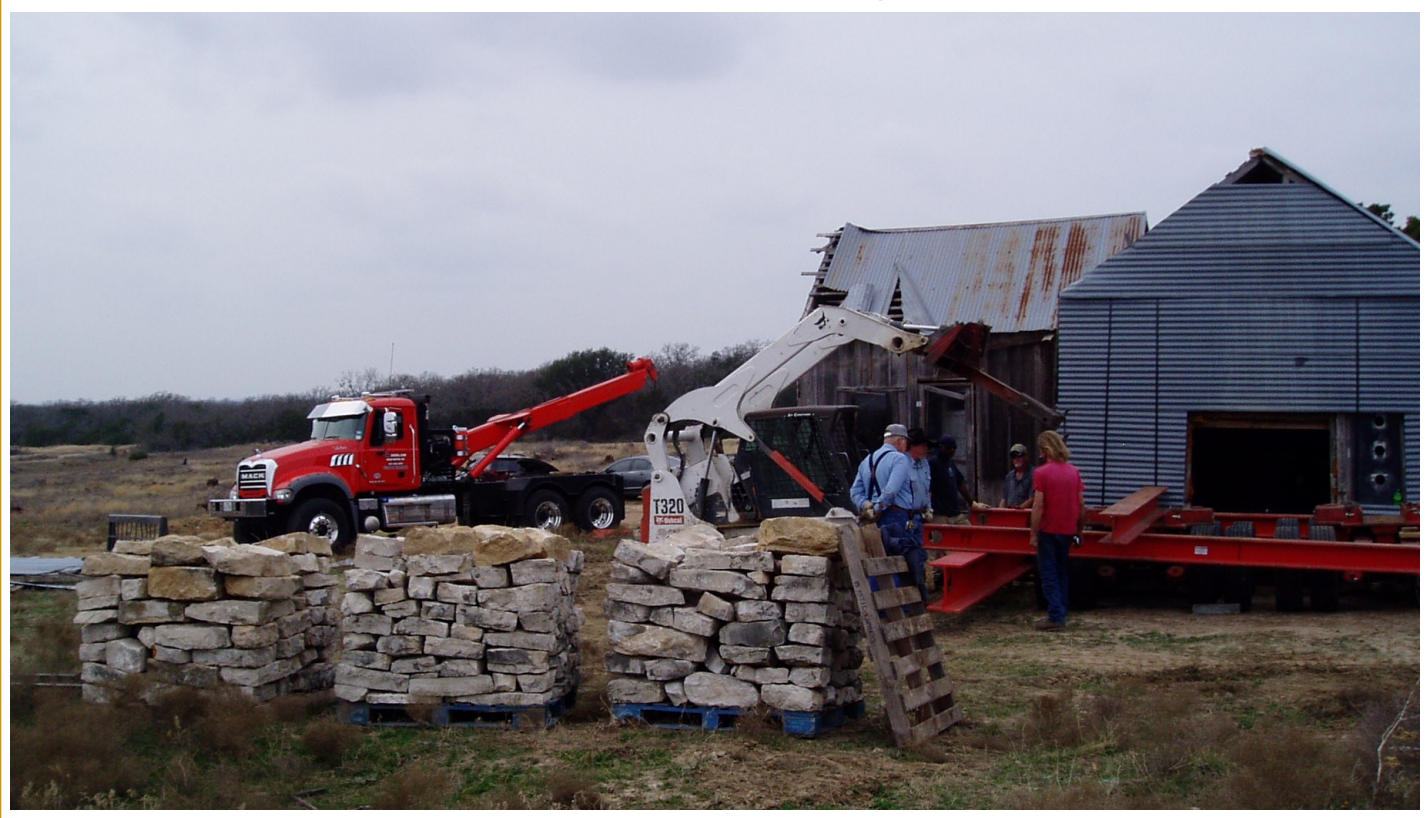
North Texas Archeological Society

Next large, heavy duty I-beams were placed underneath the Cabin. This was accomplished with the assistance of an oversized Mac truck that had both a wench line for lifting and a trailer hitch to pull the trailer once the Cabin was