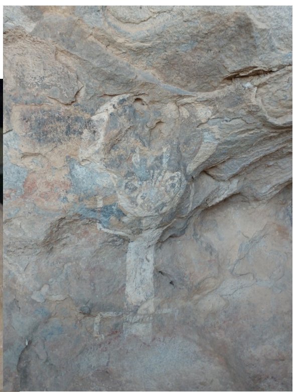
White Dancer, Huaco Tanks