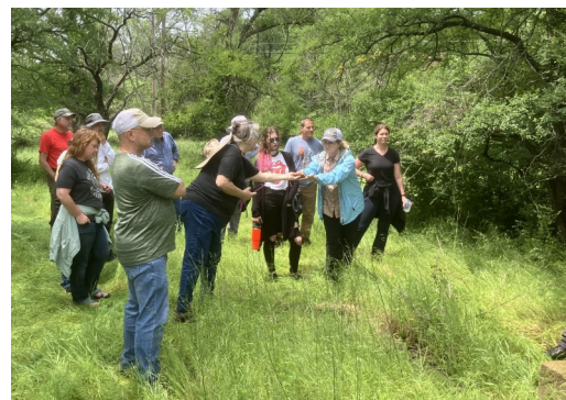
TAS Ceramics Academy participants enjoying the tour of archeological sites at the Fort Worth Nature Center & Refuge given by NTAS on Friday, April 26.