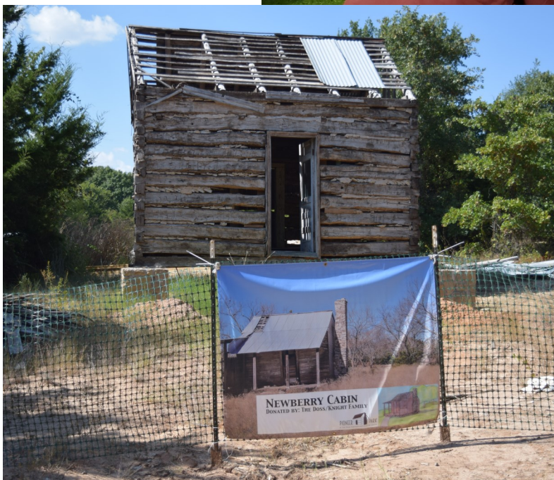
The Newberry Cabin in its new home at the Doss Heritage and Culture Center