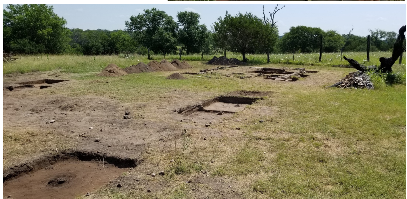
TAS Field School Excavations