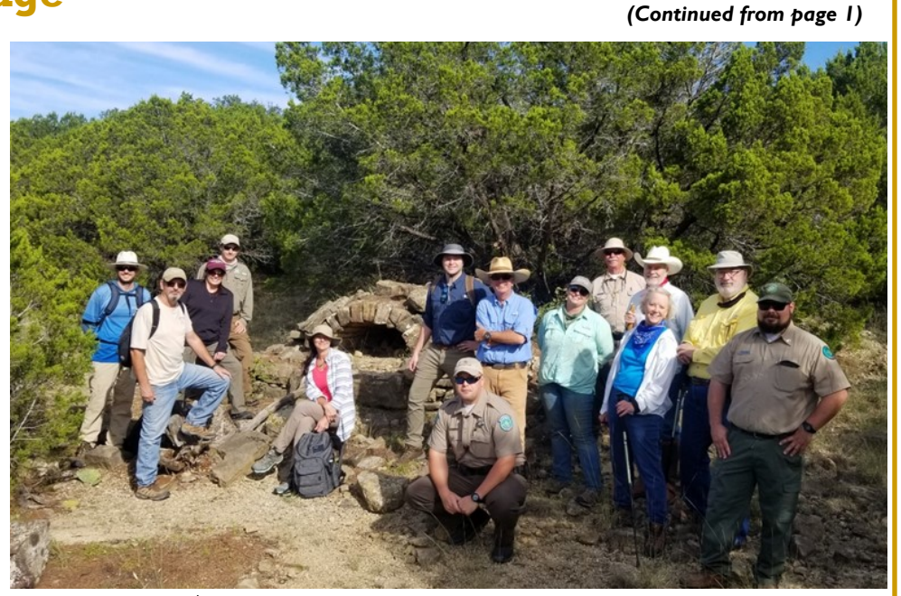
Figure 1. October 9<sup>th</sup> PPMSP group at ca. 1880 railroad oven (bread oven).