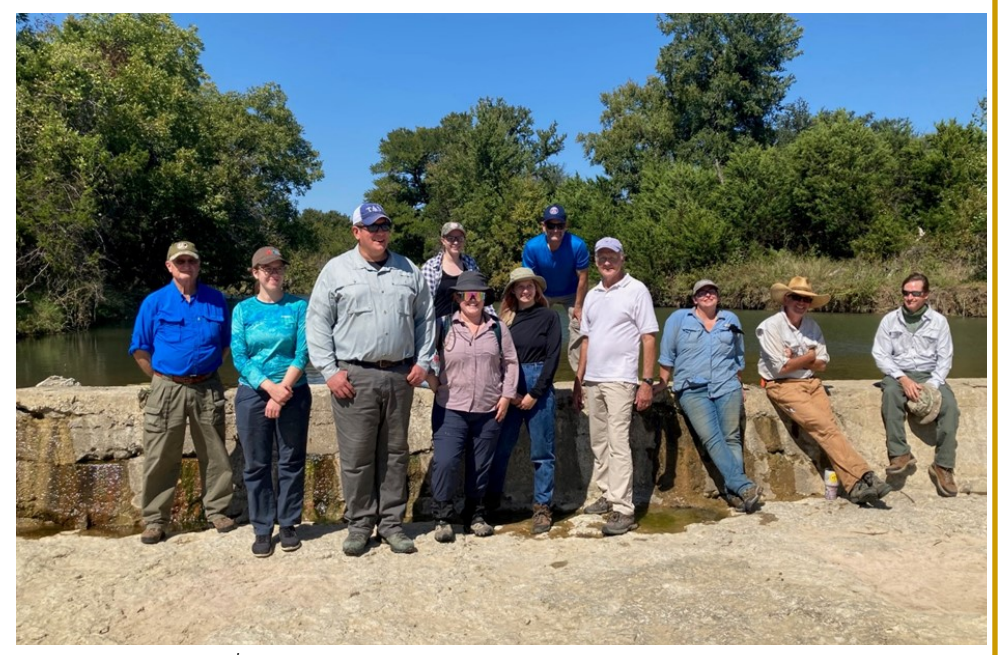
Figure 2. October 10th PPMSP group at ca. 1919 dam

teers who spent many hours preparing and to the many tremendous programs. All this preparation paid off (Figure 3)!