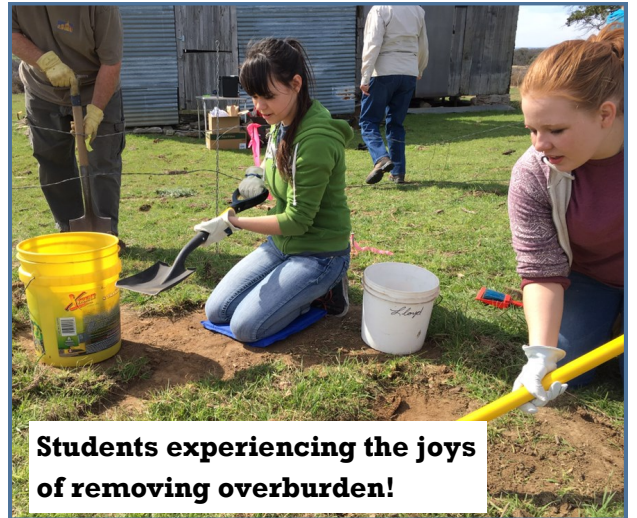
Students experiencing the joys of removing overburden!