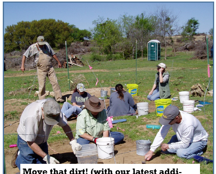
Move that dirt! (with our latest addition, Papaw's Potty in the background)