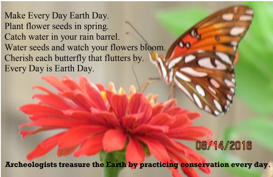
Archeologists treasure the Earth by practicing conservation every day.

Make Every Day Earth Day. Plant flower seeds in spring. Catch water in your rain barrel. Water seeds and watch your flowers bloom. Cherish each butterfly that flutters by. Every Day is Earth Day.