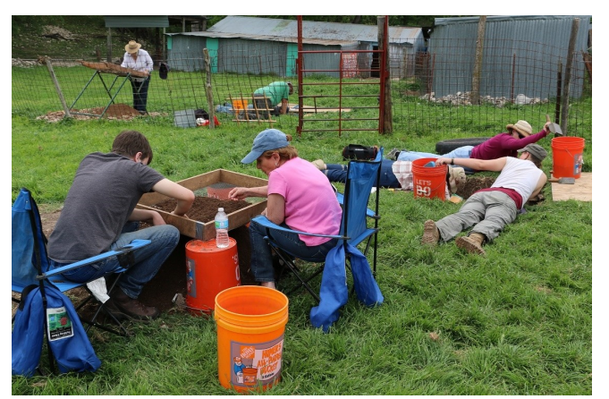
TCAS working the nitty-gritty, Smith Site, April 8th

Take comfort. Pet the dog. Head up, shoulders back. But as we leave, let's celebrate the many pleasant, enjoyable and true moments for TCAS members in 2016 with a few of our favorite photos.