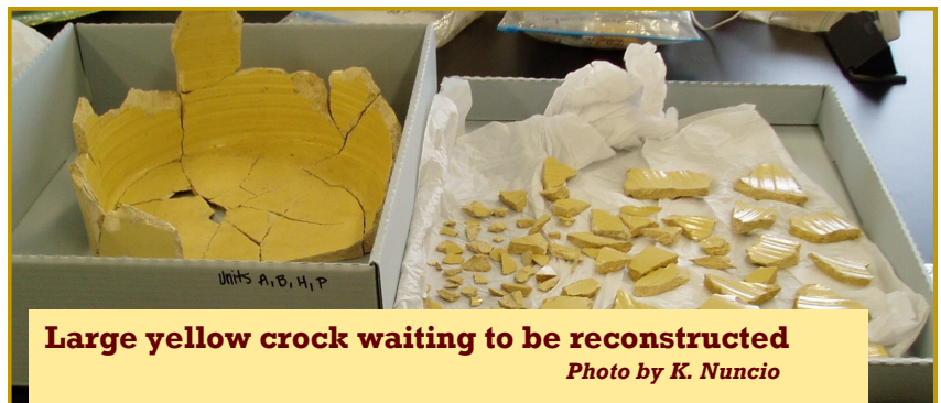
Large yellow crock waiting to be reconstructed