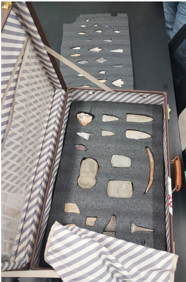
Public education kit in the SMU lab.