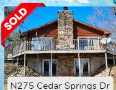
N275 Cedar Springs Dr