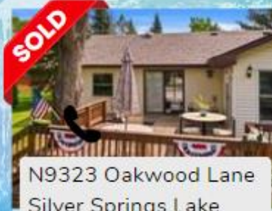
N9323 Oakwood Lane Silver Springs Lake