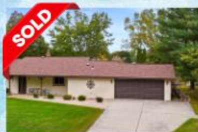
N101 E Cedar Springs Dr