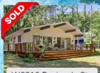
W6310 Peninsula Ct Hidden Springs Lake