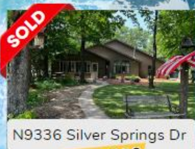
N9336 Silver Springs Dr