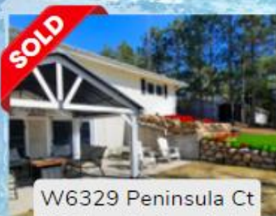
W6329 Peninsula Ct Hidden Springs Lake