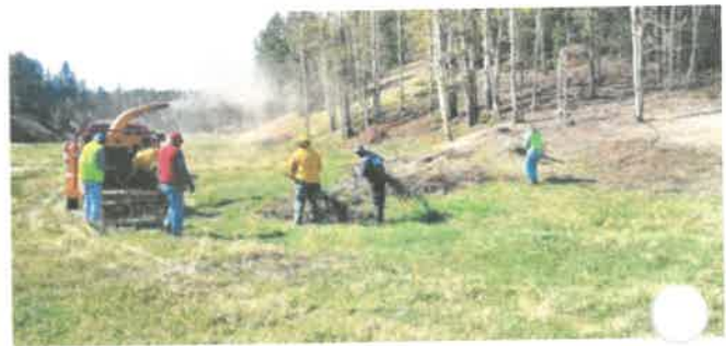
Work Crew (5-24-25)