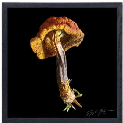
Todd Franson, Exist / Resist Subject #3, Wild Mushroom