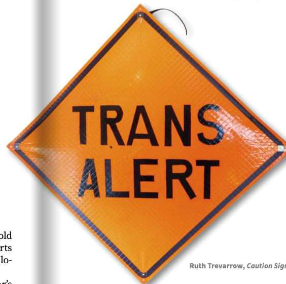
Ruth Trevarrow, Caution Sign