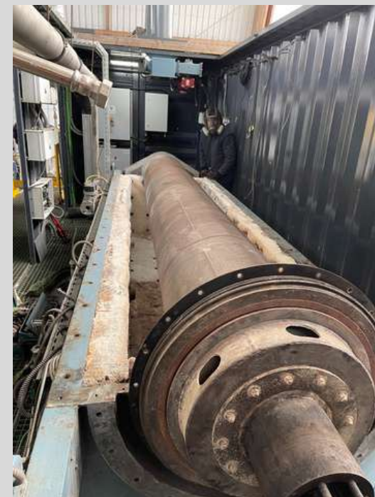
Kiln furnace reline Spain