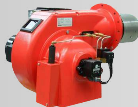
Made in the UK