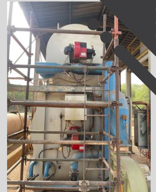
Incinerator repairs Mali