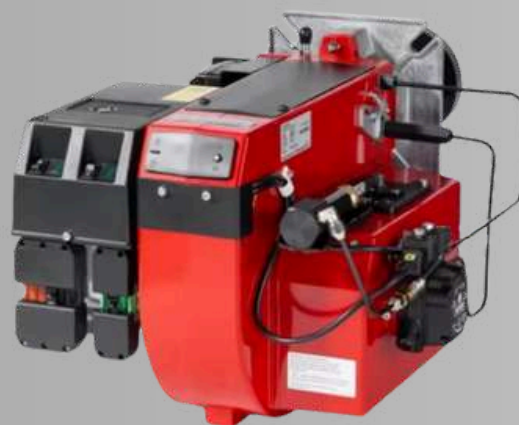
Made in Sweden