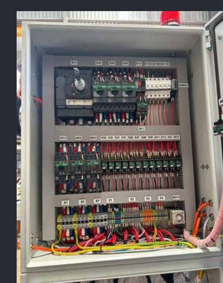
Electric Steam Boiler