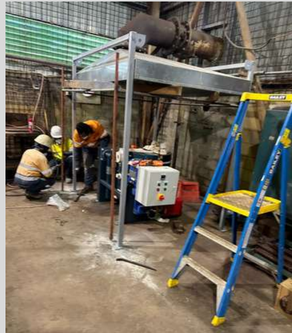
Gold furnace install Papua New Guinea