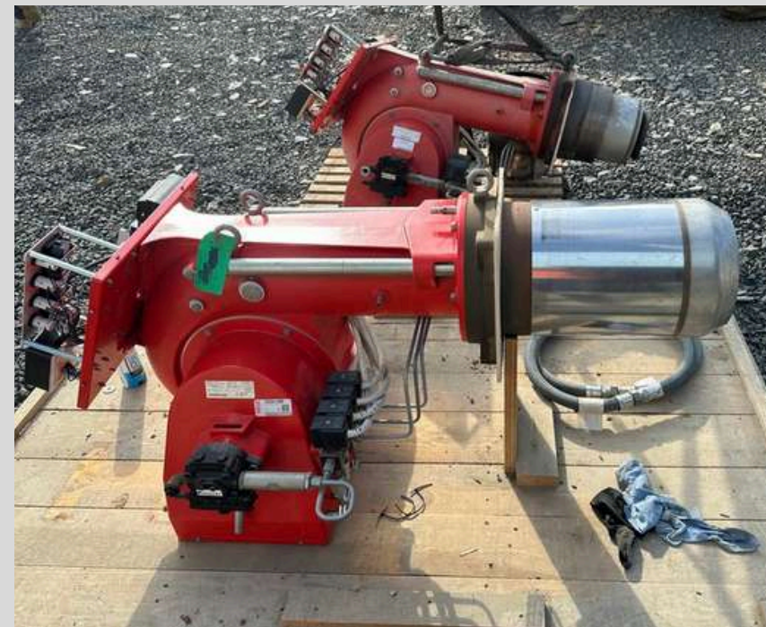
Burner commissioning Cote d'Ivoire