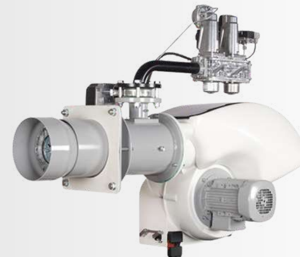
Made in Turkey

We also supply burners and spare parts for the other popular brands.