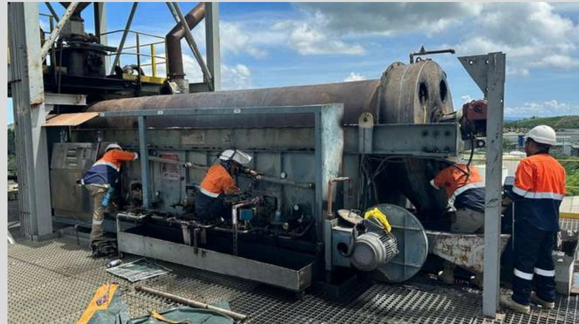
Ansac kiln rebuild & burner upgrades Philippines