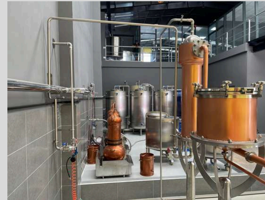
Gin distillery installation Vietnam