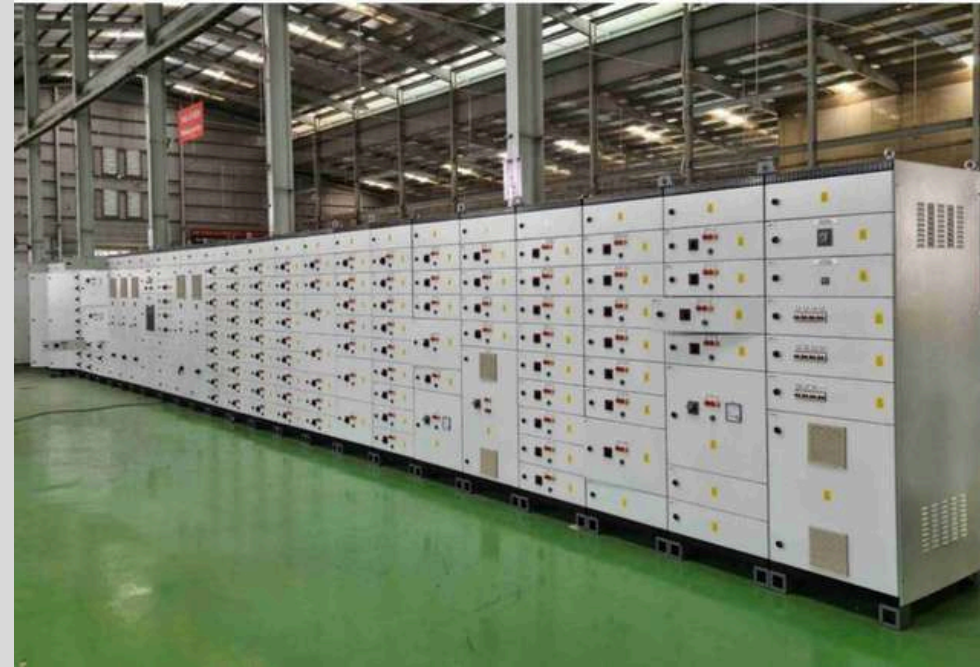
Modular panel fabrication & installation Vietnam