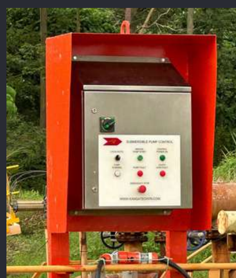
Pilbara style Submersible Pump