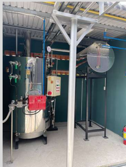
200kw boiler install Vietnam