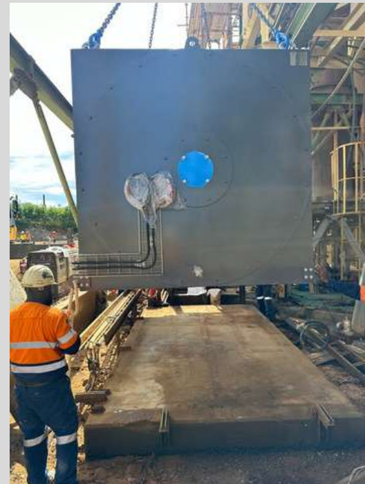
Elution heater install Papua New Guinea