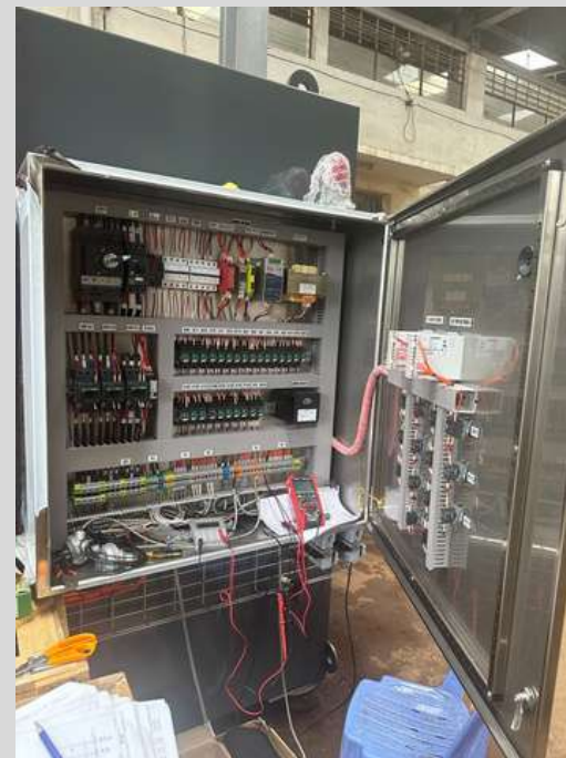
Control panel upgrade Senegal