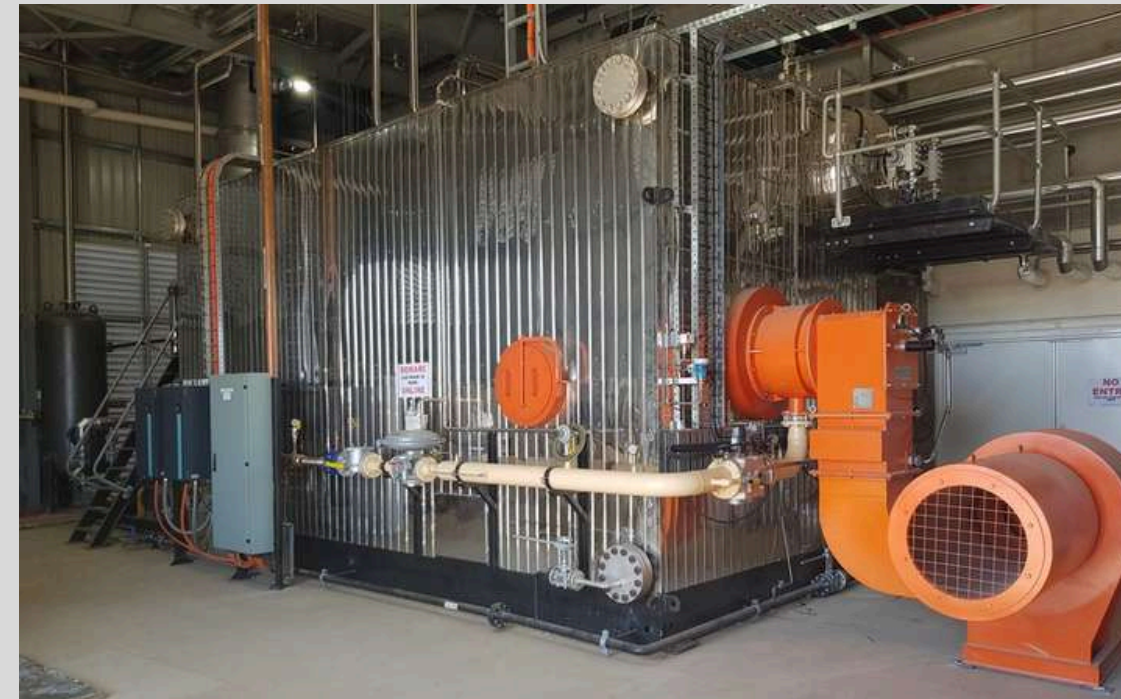
10 Mw 42 bar steam boiler commissioning Australia