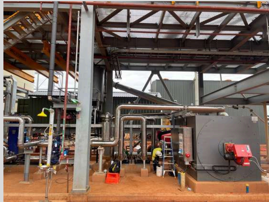
Elution Heater Commissioning Burkina Faso