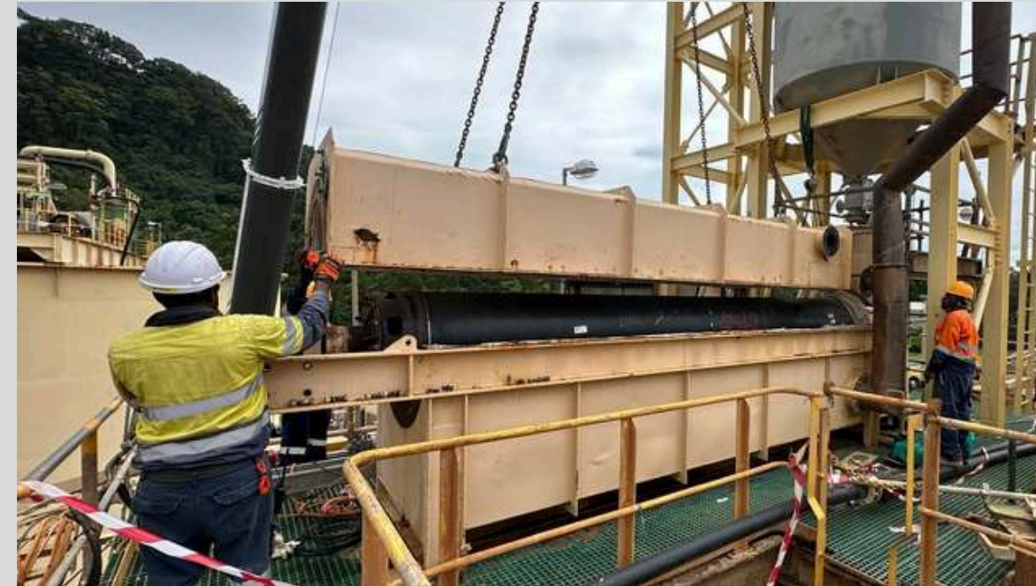
Ansac Kiln rebuild & upgrade Papua New Guinea