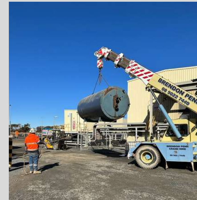
Elution heater upgrade West Australia