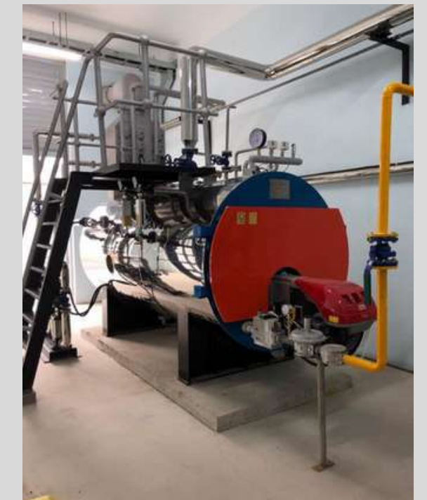
Steam boiler install Vietnam