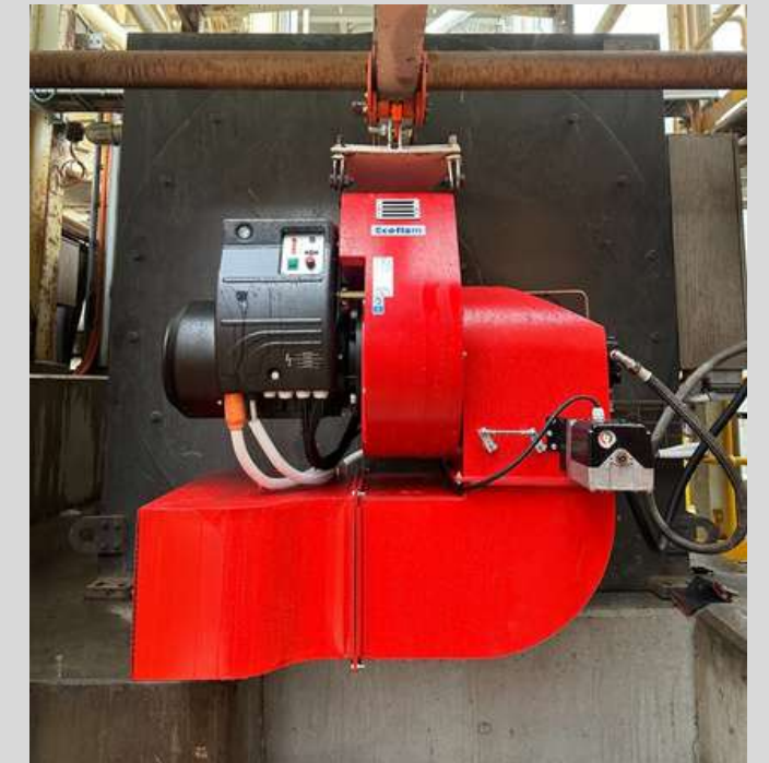
5000 Kw burner upgrade Laos