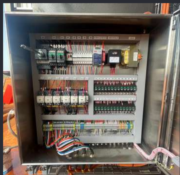
Elution Thermal Oil Heater

Our control panels are designed and fabricated in-house to the IEC 61439 Standards. The internal wiring and fit out is to the Australian Standards AS3000 & AS3008. Kangatech panels have been designed to suit existing heating appliances, straightforward controllers and suitable for the different burner varieties with minor modifications during the upgrade. We can also custom design and draft schematics to accommodate site specific requirements. From the raw material, fabrication through to the commissioning, we can offer the complete package.