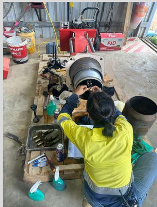
Maintenance training Cambodia