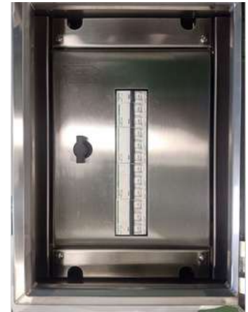
General Power Sub Boards