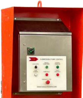
Local & Auto Submersible Pump with Flygt Floats