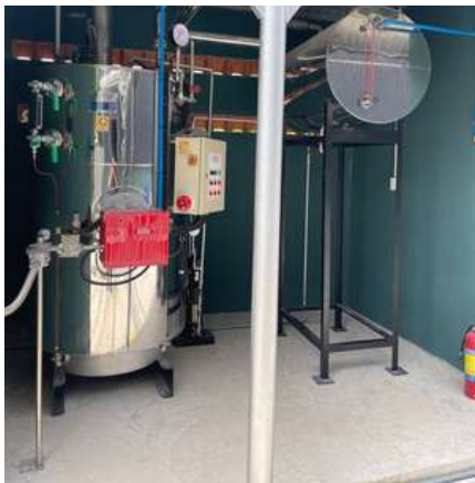
Custom steam boilers, thermal oil heater and pressure vessels .

Pressure vessels manufactured to AS1210-2010 or ASME standards by request.