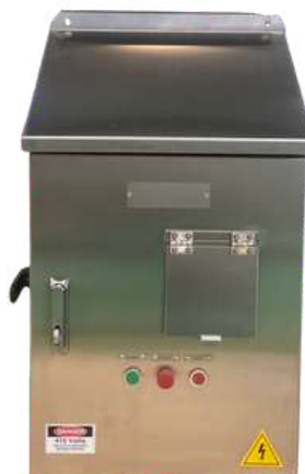
Motor Isolator & Starter Control