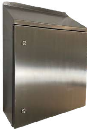
Pilbara Sloped Style