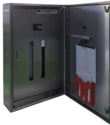
Lighting Distribution with Day/Night Lux Sensor Control