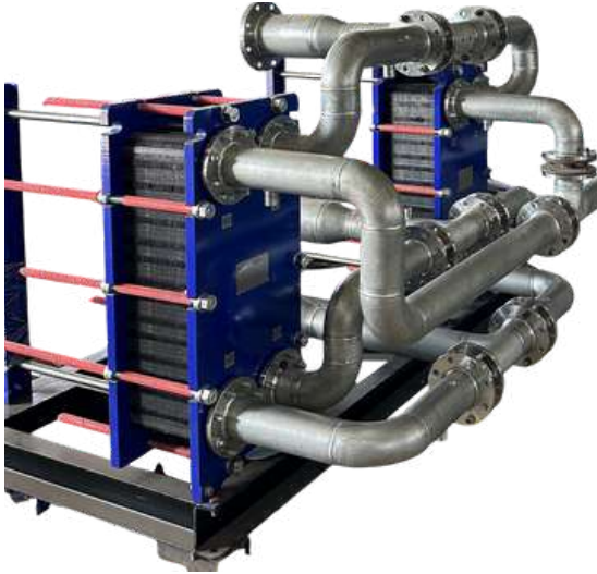
Heat exchanger skids & pipework.