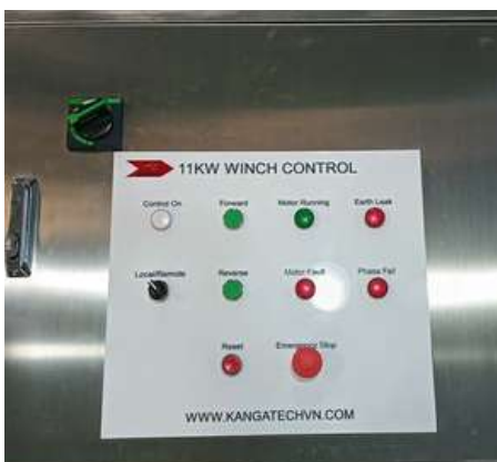
Local & Remote Controlled Winch/Hoist Control