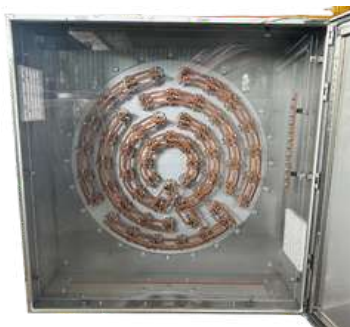
Heating Element Cable Junction Box with Safety Barrier.