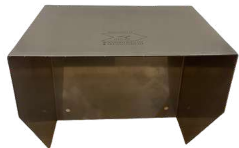
LCS & Panel Weather Protection Hood