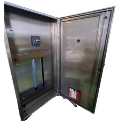
Chassis Distribution Boards