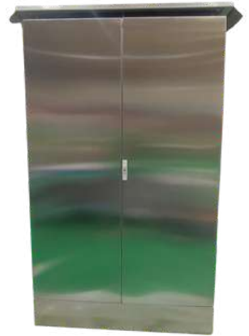
Double Door With Canopy