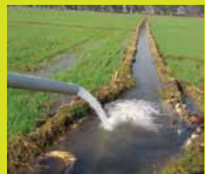
Community Water supply