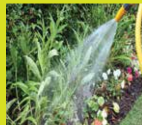
Gardening and Farm Irrigation