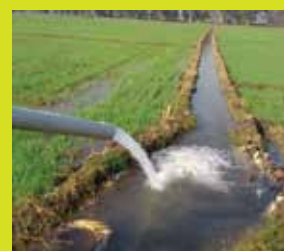
Community Water supply