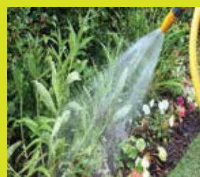
Gardening and Farm Irrigation