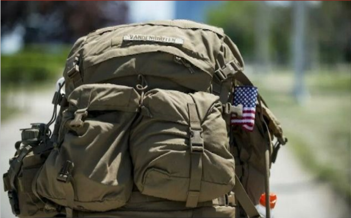
Image from Chicago ruck march held in honor of struggling veterans.