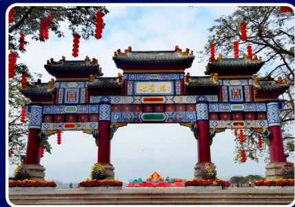
七星岩牌坊 Seven Star Crag Archway

它被誉为“梦里家园”，青石板路、小桥 流水勾勒出一幅宁静悠远的古镇画卷 People call it a 'dream-like home,' with stone roads, little bridges, and running water that show the calm beauty of an old town