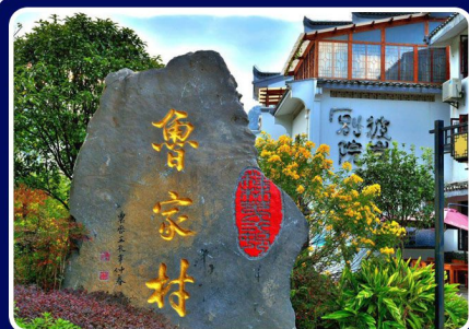
鲁家村 Lujia Village

这里是阳朔的“洋人街”，夜晚的灯光 与音乐交织出别样的国际风情 This is the 'Foreigner Street' of Yangshuo, where lights and music at night create a special international vibe