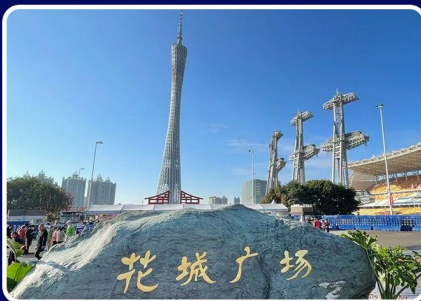
花城广场 Huacheng Square

走在上下九步行街，是逛街购物、 感受老广州文化的好去处 Walking along Shangxiajiu Pedestrian Street is a great way to shop and experience the old culture of Guangzhou