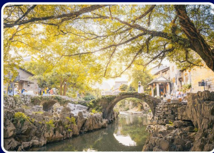
黄姚古镇 Huangyao Ancient Town

它是一处天然形成的石灰岩洞穴， 以其银白色的钟乳石而得名 It is a natural cave made of limestone, named because of its silver-white hanging stones