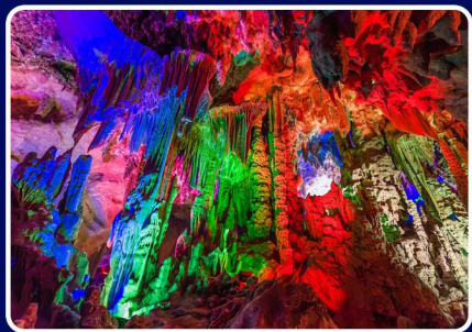
银子岩 Silver Cave

它是一处天然形成的石灰岩洞穴， 以其银白色的钟乳石而得名 It is a natural cave made of limestone, named because of its silver-white hanging stones