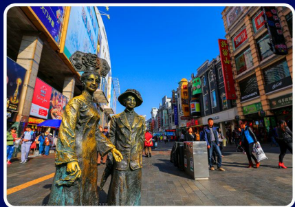
上下九步行街 Shangxiajiu Street

它是一座古老的村庄，展现了当地 的民俗风情和乡村生活 It is an old village where you can see local traditions and country life