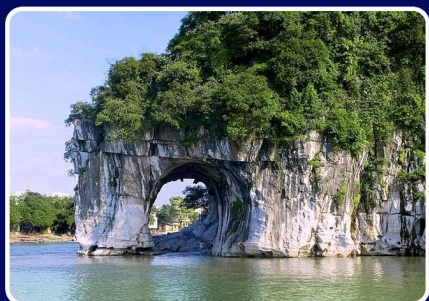
象鼻山 Elephant Trunk Hill

它不仅是七星岩的象征，更是一段 岭南文化的石刻记忆 It's not just a symbol of the Seven Star Crag, but also a part of Lingnan's cultural history carved in stone