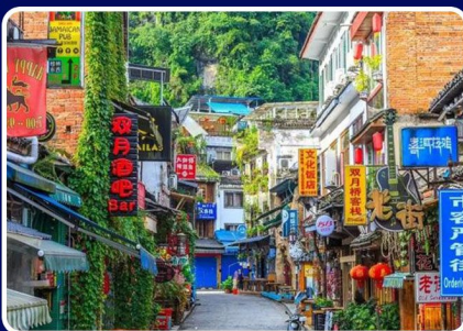
洋人西街 West Street

它是广西桂林的著名地标，因形似 一头伸鼻子喝水的大象而得名 It is a famous landmark in Guilin, Guangxi, named because it looks like an elephant drinking water with its trunk