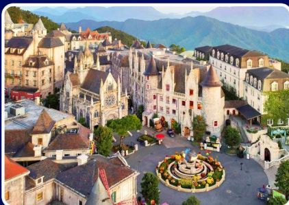
巴拿山法国村 Ba Na Hills French Village

My Khe Beach is the most famous beach in Da Nang, Vietnam. It is known for its soft white sand and clear water