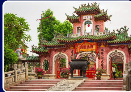
福建会馆 Fujian Assembly Hall

The Royal Palace shows the special beauty of Vietnamese royal architecture. It is a shining gem in the city