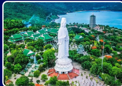
灵应寺庙 Linh Ung Pagoda

It is a famous bridge on Ba Na Hills. Two big stone hands hold up the bridge