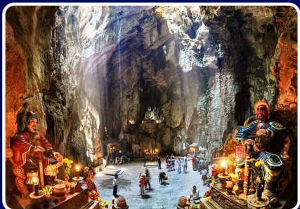
五行山 Marble Mountain

Fujian Assembly Hall is a well-known Chinese meeting place in Hoi An. People also call it Jinshan Temple