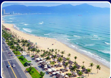
美溪海滩 My Khe Beach

Linh Ung Pagoda is a famous Buddhist temple in Da Nang, Vietnam. Inside, there is a big statue of the Goddess of Mercy that is 67 meters tall