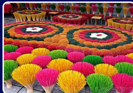
顺化沉香村 Hue Agarwood Village

At Ba Na Hills French Village, you can enjoy French culture, taste delicious food, and see beautiful mountain views