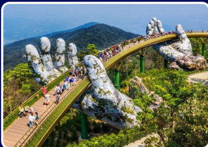
佛手桥 Golden Bridge

Marble Mountains are made of hard marble and limestone. Because of this, there are many caves and Buddhist temples