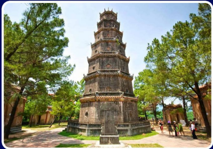
天母寺 Thien Mụ Pagoda