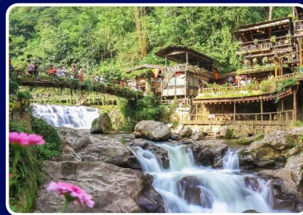
猫猫村 Cat Cat Village

它是越南儒学文化的重要象征, 也是古代士子求学和科举考试的圣地 It is an important symbol of Confucian culture in Vietnam and was a place where students studied and took exams in the past