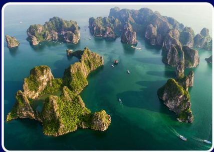
下龙湾 Halong Bay

它是越南著名的世界自然遗产, 以碧绿的海水和奇特的石灰岩岛屿而闻名 It is a famous World Natural Heritage site in Vietnam, known for its green water and strange limestone islands