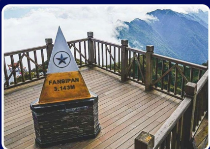
番西邦峰 Fansipan Peak

这是一个历史悠久的苗族村庄, 有梯田、瀑布和吊桥等自然与人文景观 This is a historic Hmong village with rice terraces, waterfalls, and hanging bridges