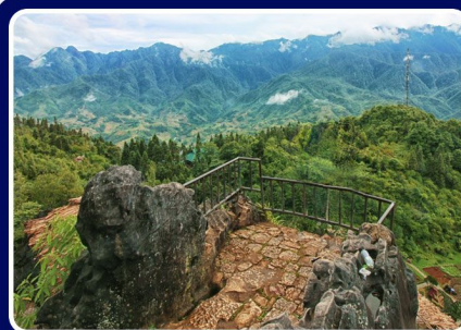
含龙山 Ham Rong Mountain

走在云龙玻璃栈道上, 仿佛悬浮在空中, 感受大自然的壮丽与震撼 Walking on the Yunlong Glass Skywalk feels like floating in the air, surrounded by the beauty and power of nature