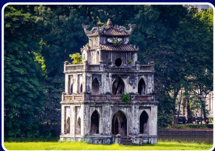
还剑湖 Hoan Kiem Lake

登上含龙山, 可以俯瞰周围的山谷和村庄, 体验宁静的自然氛围 Climbing Ham Long Mountain lets you see the valleys and villages around, and enjoy the peaceful nature