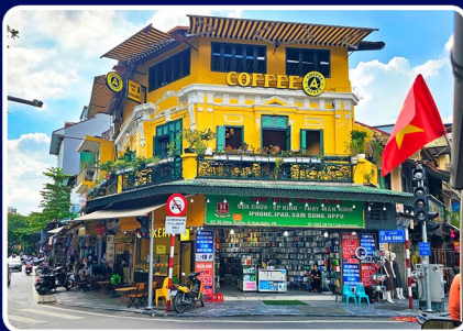
三十六古街 Hanoi's Old Quarter (36 Streets)

湖中心的龟塔和岸边的玉山寺, 使还剑湖成为一处迷人的景点 Turtle Tower in the middle of the lake and Ngoc Son Temple by the shore make Hoan Kiem Lake a lovely place to visit