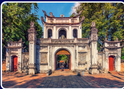
河内文庙 Temple of Literature

它是越南著名的世界自然遗产, 以碧绿的海水和奇特的石灰岩岛屿而闻名 It is a famous World Natural Heritage site in Vietnam, known for its green water and strange limestone islands