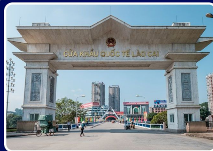
老街省 Lao Cai

走进三十六古街, 就像走进河内的过去, 街道间充满地道的越南风情 Walking into the Old Quarter feels like stepping into Hanoi's past. The streets are full of real Vietnamese charm